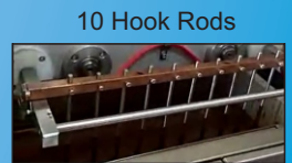
10 Hook Rods