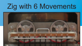
Zig with 6 Movements