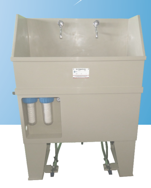
Hand Wash Stand with 2 taps - 1 MT