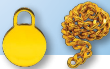
Gold 24 kt