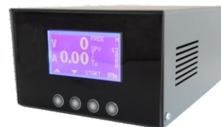
Rectifier 40 V - 2 Amp