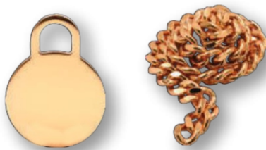
Red gold 5N