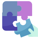
Nesting auto Placement