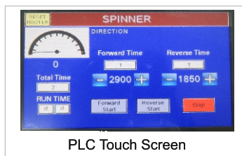
PLC Touch Screen